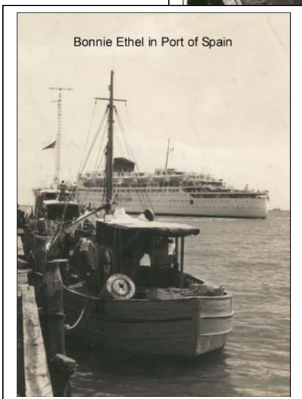
Bonnie Ethel in Port of Spain

Below: Day of arrival in PORT OF SPAIN, TRINIDAD, tied up ahead is the converted minesweeper HMS PRIVATEER, Out in the bay is French